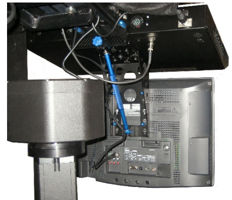
Note the heavy duty truss assembly with dynamic stabilization arm

Tekskil Quality Engineered for your Studio