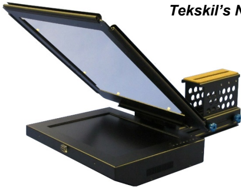
15P-F with H15 Beamsplitter

These prompters are the ultimate in readability – distances of 20 feet or more are no problem. And those prompter displays are integrated with our signature extruded aluminum frame rail and docking hardware for a truly portable product.