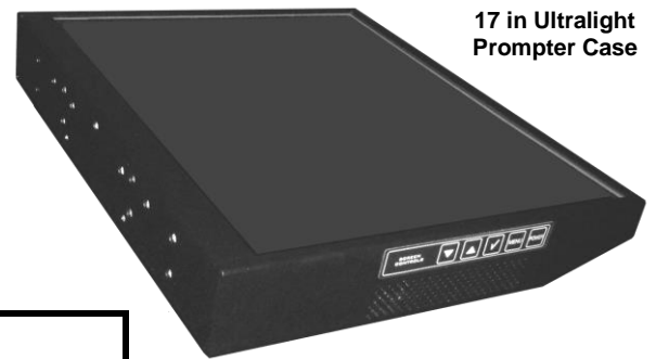
17 in Ultralight Prompter Case