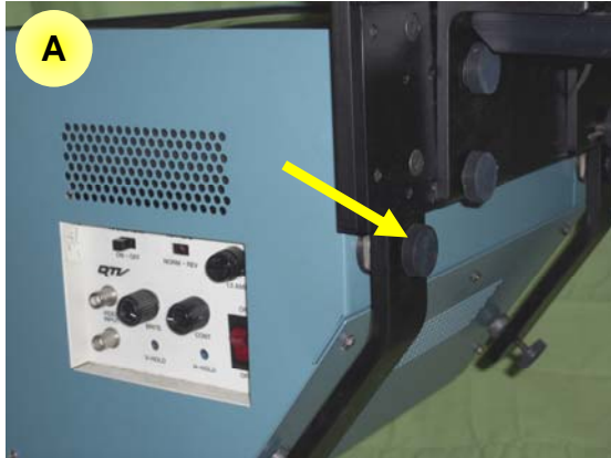
A Start by removing the old CRT. There are 2 thumbscrews to unscrew - they can be used to mount the new display.