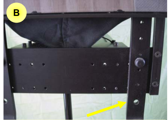
B Remove both CRT support arms – these are fastened from the back with allen head screws.