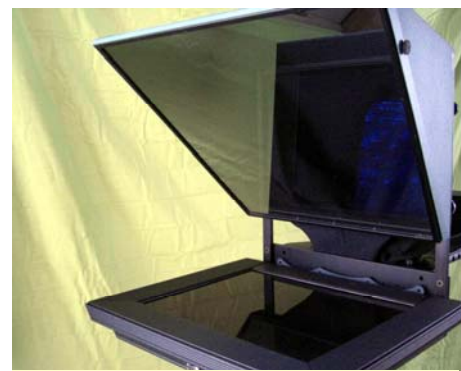
Your new Tekskil prompter is set to go!