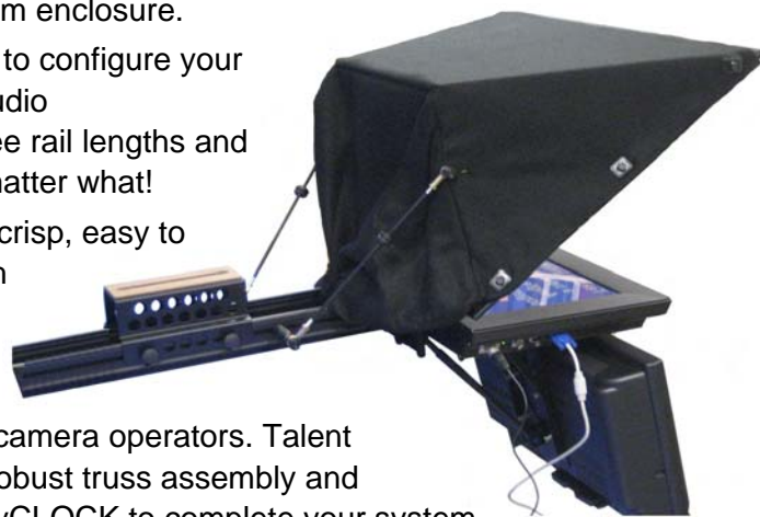
19SE-HD with H30 wide angle Hood And 22" Talent Assist/Aux Monitor

Features: Enhanced contrast and panel brightness provide a crisp, easy to read talent display. Three image sizes – 15", 17" and 19" with push button ease from a built-in custom scaler. An optional HD-SDI video input is available. Dynamically stabilized and dampened beamsplitters eliminate lens shutter and screen shake resulting from aggressive pan/tilts or overly exuberant camera operators. Talent Assist/Aux displays are also treated to vibration control by a robust truss assembly and dynamically tensioned arm. Add our TallyCAM display or TallyCLOCK to complete your system.