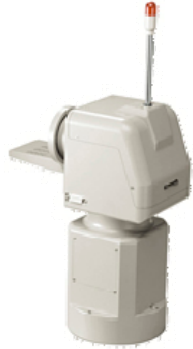
AW-PH400 Load: 17.6 lbs.