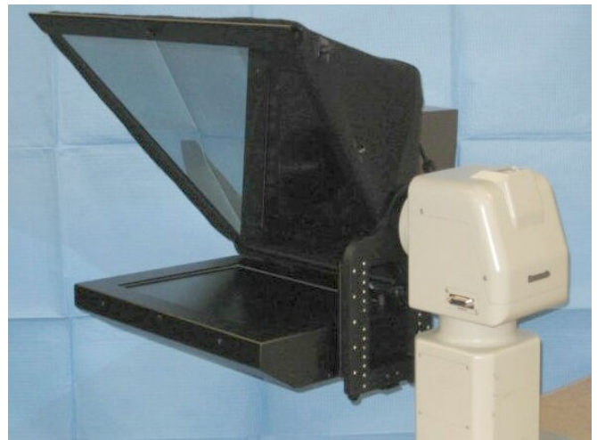
15V-R with P90 Dynamically Balanced Cradle on a Panasonic AW-PH405 Pan & Tilt