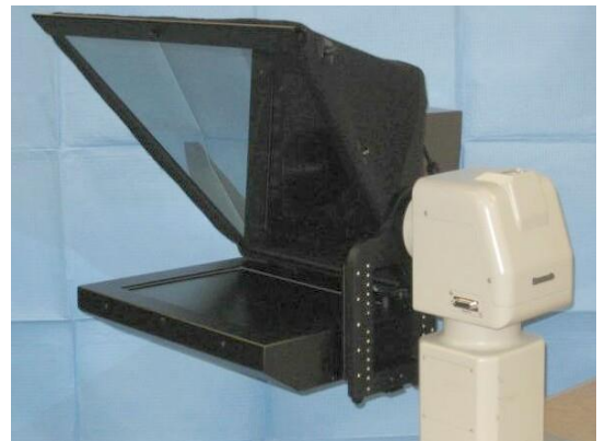
15V-R with P90 Dynamically Balanced Cradle on a Panasonic AW-PH405 Pan & Tilt