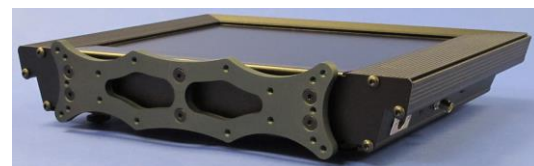
17P with QTV and Listec Mount