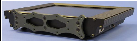
15E Replacement LCD Panel shown with custom QTV and Listec combination mount

A Tekskil LCD Teleprompter is a proven solution - contact us for details.