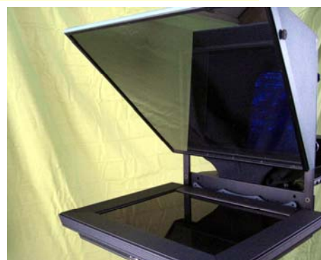
Your new Tekskil display is set to go!