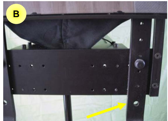
B Remove both CRT support arms – these are fastened from the back with allen head screws.