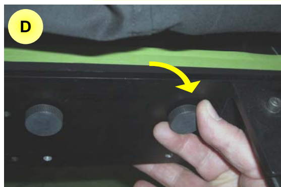
D Connect the new LCD to the backplate with thumbscrews or the supplied conversion hardware