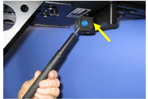
Slide upper end of Aux Display Support arm into the slot in the Rail face plate and secure with thumbwheel