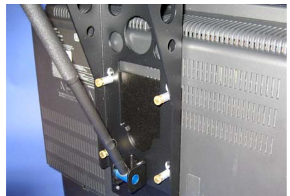
Tighten the thumbsnails (blue barrel nuts) to secure the Auxiliary Display to the support bracket