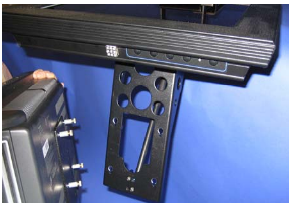
Dock the Auxiliary Display to the support bracket by inserting the 4 knurled thumbsnails into the keyholes