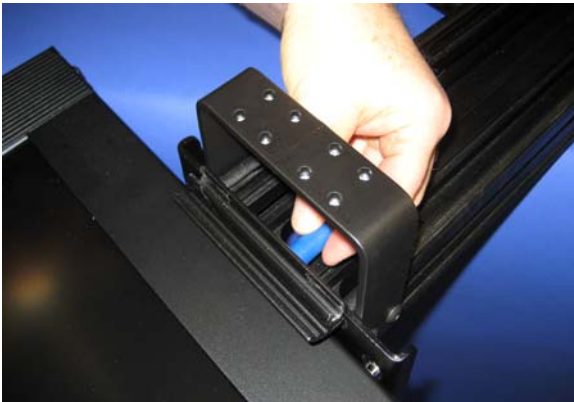
Dock Prompter Display studs (2) into the Rail plate keyholes and lock in place with the blue barrel nut