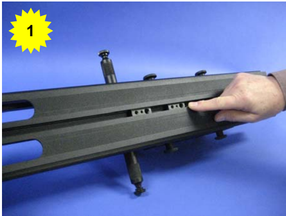
Attach Rail to Pan/Tilt cradle with sliding T-nuts. Lower Stabilizer Mounts are factory set to either Rail or Camera Riser locations (to match Lens Frame type).

If you have questions or suggestions – call us toll-free at 877-Tekskil (835-7545)