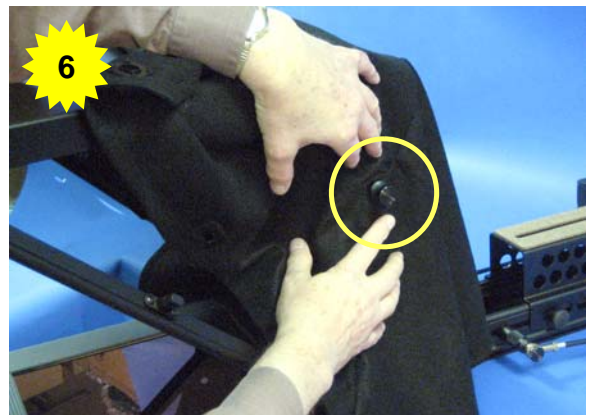
Fasten Beamsplitter Shroud to Frame (insert Stabilizer Mounts through appropriate pockets)