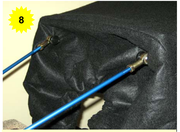
Connect Stabilizer Rods to Lens Frame Mounts and tension slightly