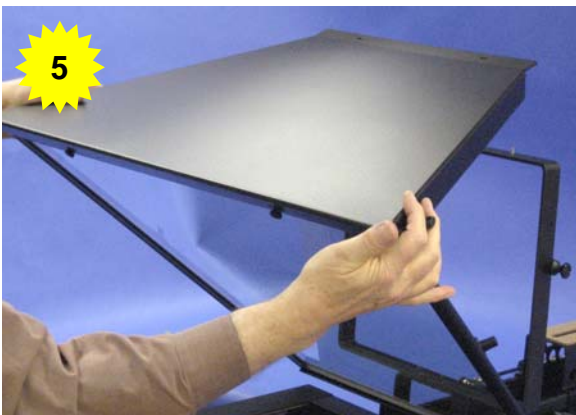
Install top panel – fasten front thumbscrews and top acorn nuts