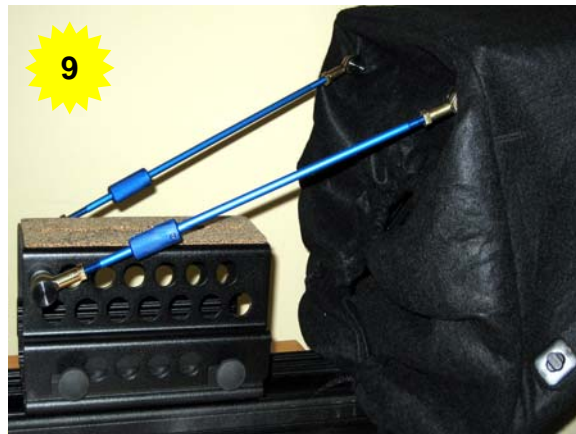
Mount the camera and fine balance the completed assembly. Stabilizer rod tension should be adjusted if vibration does not dampen appropriately.