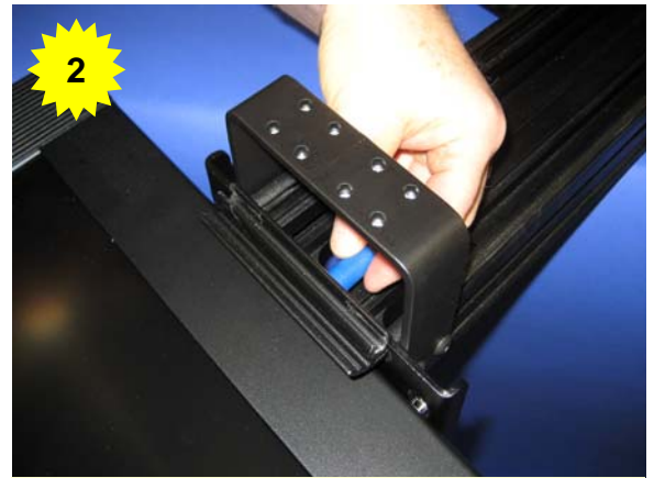
Dock Main Display studs to Rail Plate keyholes - lock in place with blue barrel nut