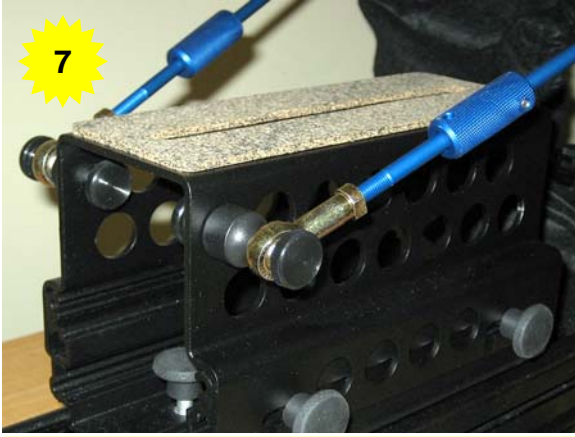
Connect Stabilizer Rods to Camera Riser Mounts